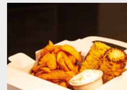
French fries Cooking method: Convection 18 kg in 18 minutes