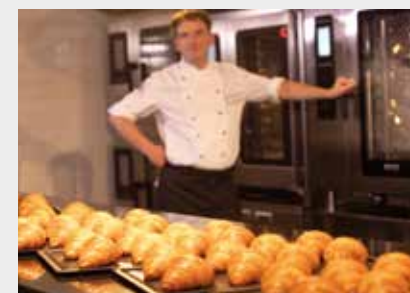
Croissants (70g) Cooking method: BakePro 80 pieces in 19.5 minutes