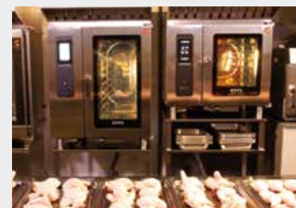
Chicken on the Bone Cooking method: Crisp&Tasty 22 kg in 30 minutes