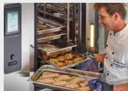
Poached fillet of salmon Cooking method: Combi-steam 20 kg in 28 minutes