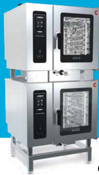
Quantities in a Convotherm maxx 10.10: