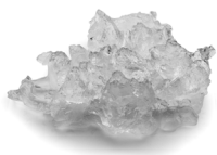
AF 80 Flake ice Residual water content 25%