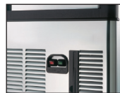
Front ON-OFF Switch