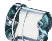
Ø 38 x H 41 mm