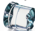
Ø 29 x H 34 mm