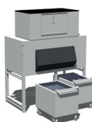
MAR 208+SIS1350 (sold separately)