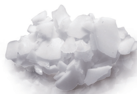
Residual water content 2%

Ice scales are the coldest form of ice. Formed at -6° to -12°Celsius, they are very dry, containing less than 2% residual water. Scales look like fragments of glass, have an irregular shape and a thickness that can be adjusted at 1 or 2 mm.