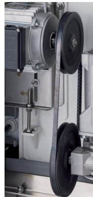
Pulleys & belt system allows to modify ice thickness