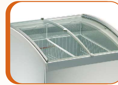
CURVED SLIDING GLASS LIDS