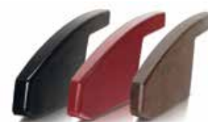
Black Red Wood