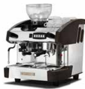
Mini Control 1 GR with grinder, wood