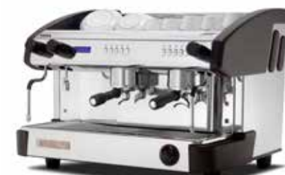
Display Control 2 GR, wood