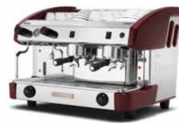
Pulser 2 GR, red