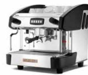
Mini Control 1 GR, black