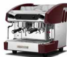
Mini Pulser 2 GR, red