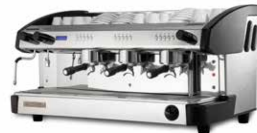
Display Control 3 GR, black