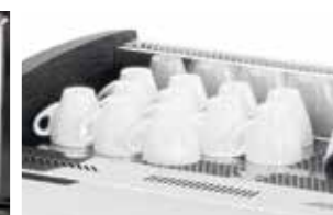
Cup tray with great capacity