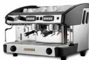
Control 2 GR, black