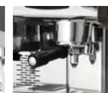
Capsule system: adjustment of the group head to capsule