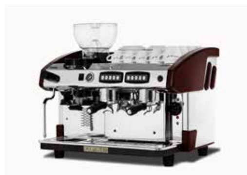
Control 2 GR with grinder, red, take away