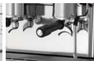
Components of the highest quality