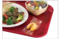
Fast Food Trays