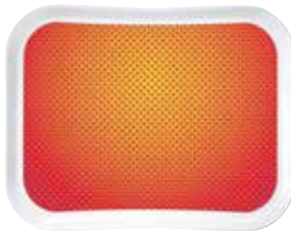
Create a pattern design.