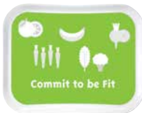
Create one with a helpful message.