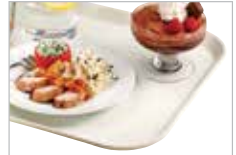
Versa Lite Trays