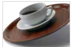
Laminated Mykonos Trays