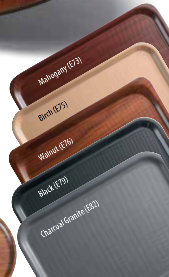
MY4300 Teak (E77)