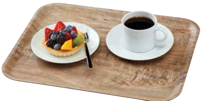
Brown Olive (E90)