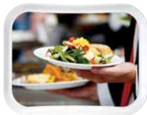
Create one with a beauty shot.