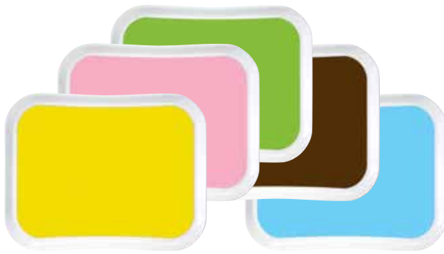
Create your own colour.