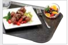
Versa Trays Eco Green

All Cambro trays are submitted to an array of tests described on the following page. The results are indicated on each tray page under Technical Test Results.