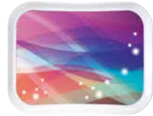
Create one with your imagination.

Other sizes are available. Contact our customer service for more information.