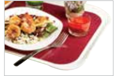
Polyester Century Fun Trays