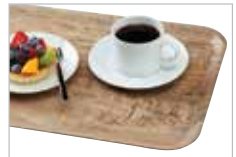
Laminated Madeira Trays