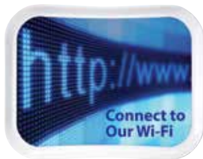
Create one announcing a service for customers.