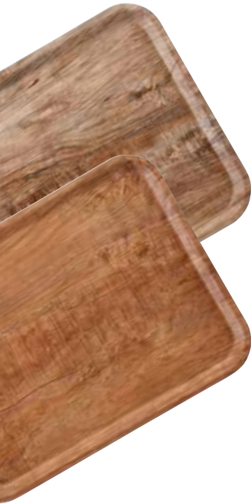
Light Olive (E89)