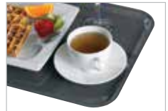
Laminated Capri Trays