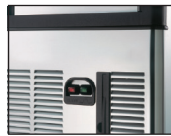
Front ON-OFF Switch