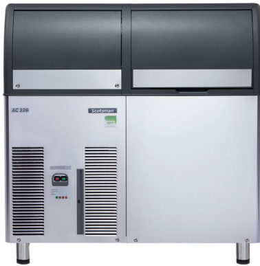
Noiseless bin door