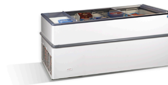
CRYSTALLITE 15 1554 x 914 x 840 600lt

CRYSTALLITE 15 • CRYSTALLITE 20 • CRYSTALLITE 25