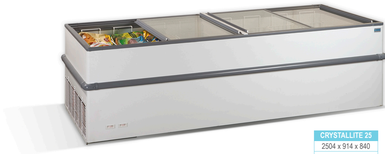
CRYSTALLITE 25 2504 x 914 x 840 1050lt