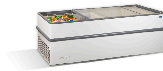
CRYSTALLITE 20 2004 x 914 x 840 800lt