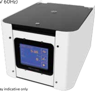
Display indicative only