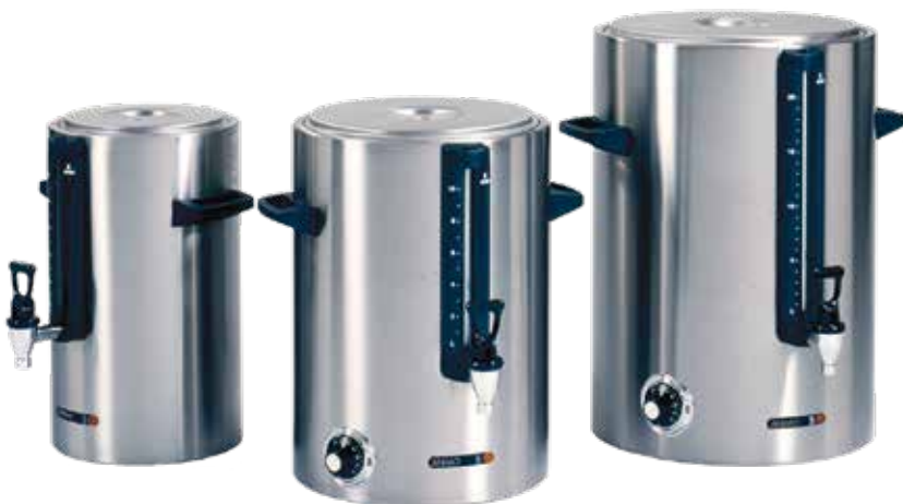
+ WKT-D - series