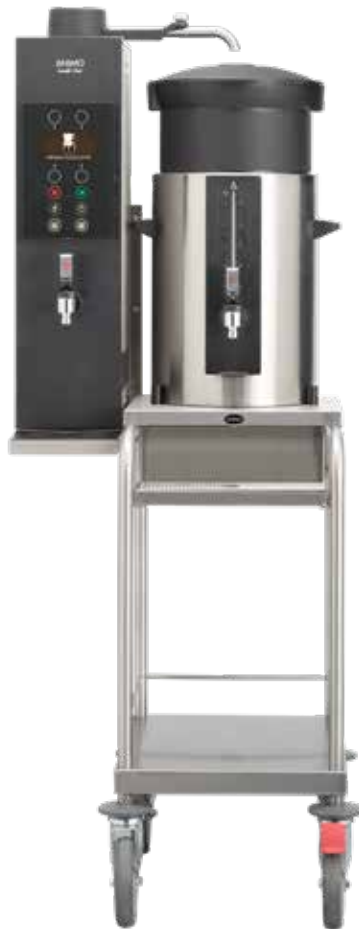
+ Type - J