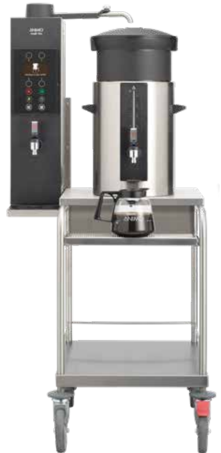
+ Type - S (Type - C is suitable for 2 containers)