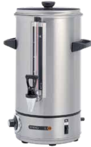
+ WKT - series