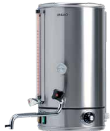
+ WKI - series