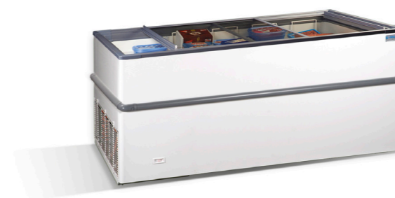
CRYSTALLITE 15 1554 x 914 x 840 600lt

CRYSTALLITE 15 • CRYSTALLITE 20 • CRYSTALLITE 25