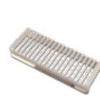
Easy for external vacuum