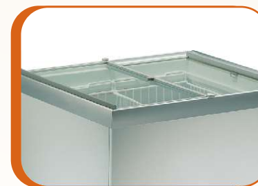
FLAT SLIDING GLASS LIDS