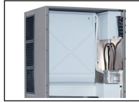
Vertical Cube System