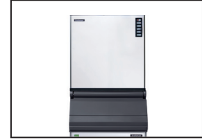
T304 Stainless Steel Panels