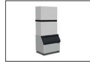
Double Stack (Needs a stacking kit sold separately)