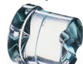
Ø 38 x H 41 mm