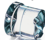
Ø 29 x H 34 mm