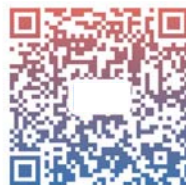
Smart Coffee Scale

1. Scan the below QR code to download "Smart Coffee Scale" application for iOS